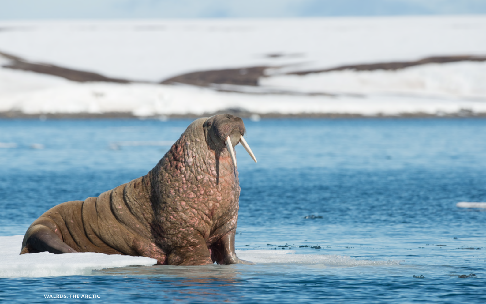
WALRUS, THE ARCTIC