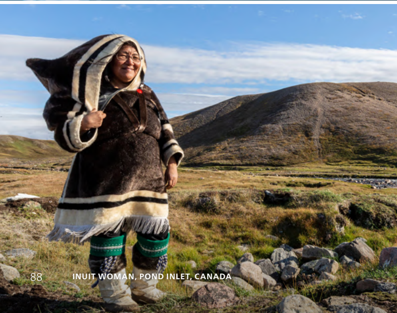
88 INUIT WOMAN, POND INLET, CANADA