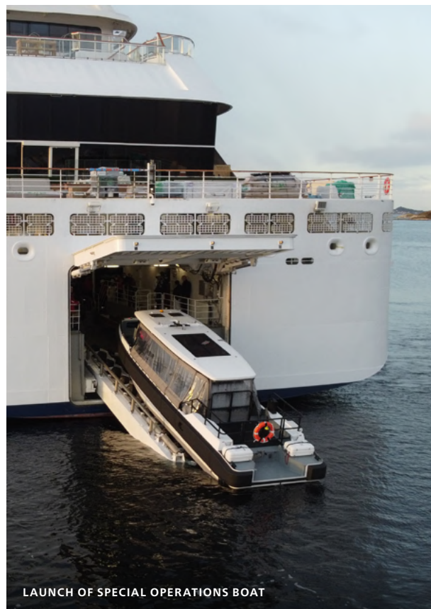
LAUNCH OF SPECIAL OPERATIONS BOAT