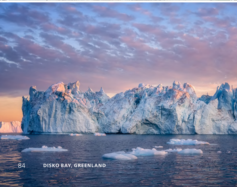
DISKO BAY, GREENLAND