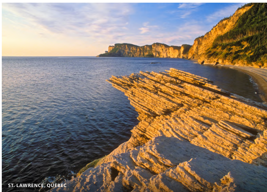
ST. LAWRENCE, QUÉBEC

High Arctic and Greenland's rugged shores on an awe-inspiring journey through one of the most fascinating corners of the world. Sail amid floating icebergs as they drift in blue-tinged waters and witness the wonders of Mother Nature as you immerse yourself in dramatic landscapes. Learn about the Inuit traditions that still thrive in remote communities and experience the stark beauty of the Arctic beneath the skies of the midnight sun.