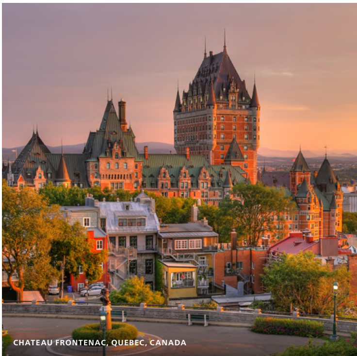
CHATEAU FRONTENAC, QUEBEC, CANADA