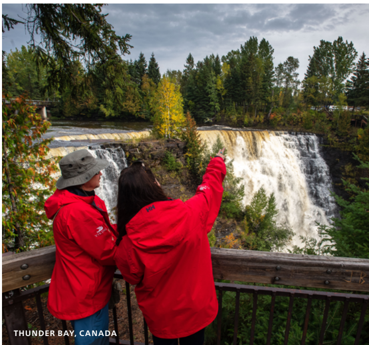
THUNDER BAY, CANADA