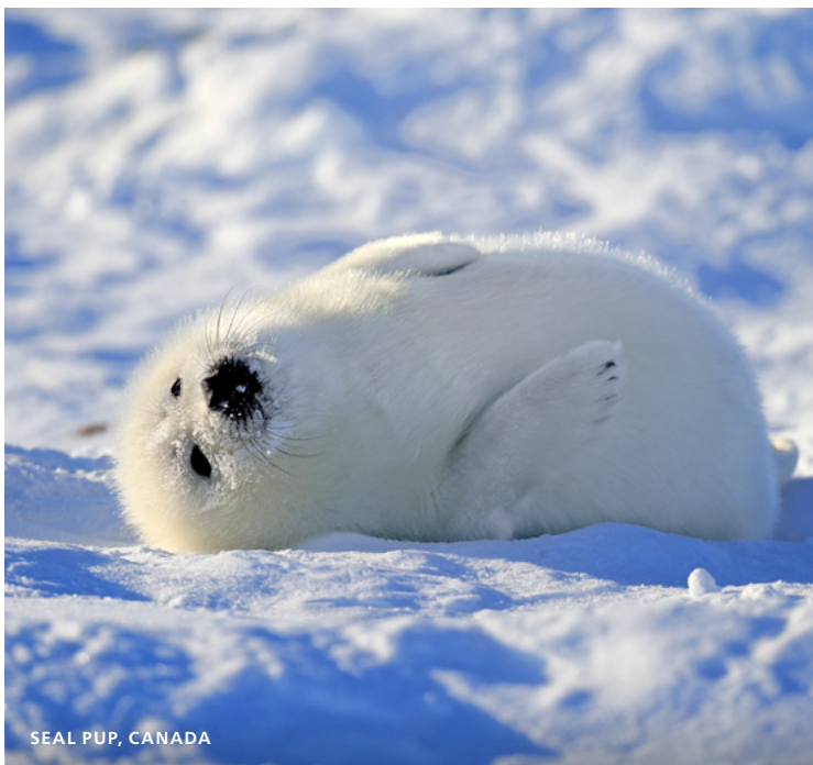
SEAL PUP, CANADA