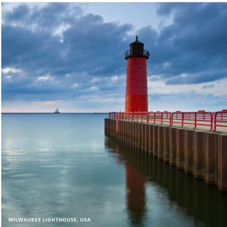
MILWAUKEE LIGHTHOUSE, USA