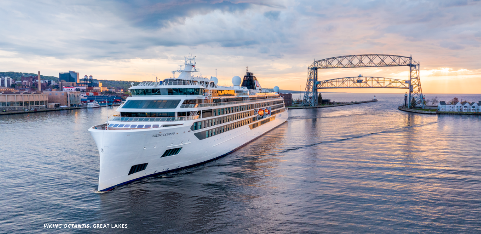
VIKING OCTANTIS, GREAT LAKES