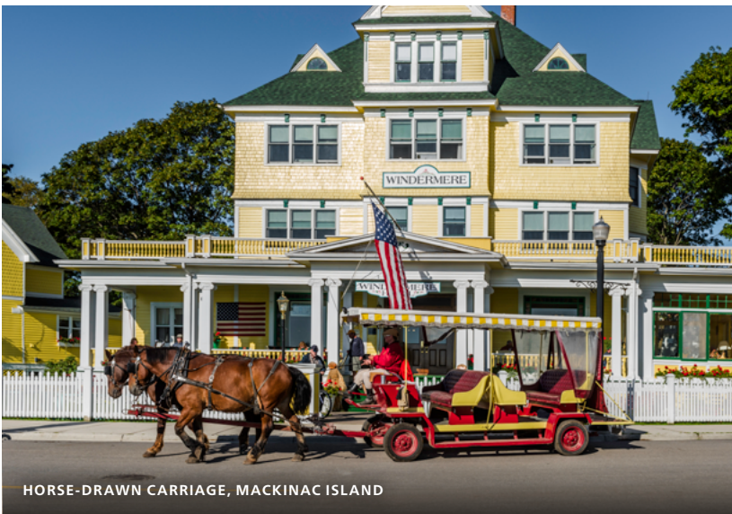
HORSE-DRAWN CARRIAGE, MACKINAC ISLAND