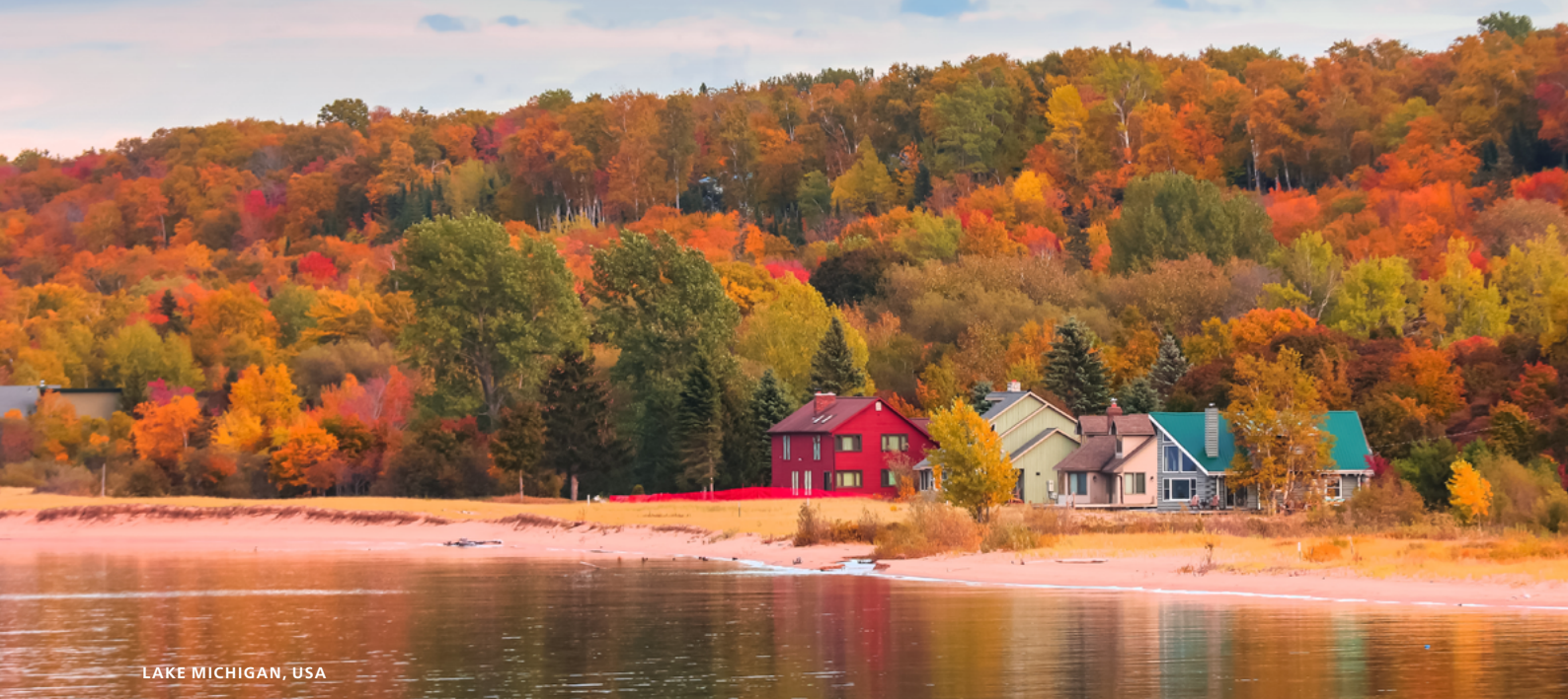
LAKE MICHIGAN, USA

LEGENDARY WATERS & SCENIC LANDSCAPES. Join Viking for a unique expedition across the historic waterways of all five of the majestic Great Lakes. Experience culture-rich urban centers and admire the incredible power of thundering Niagara Falls. Explore the granite islands and sheltered inlets of Georgian Bay and traverse the famous Soo Locks. Study the aquatic ecosystems of the lakes and venture into the dense boreal forests that line the shores of Lake Superior and Lake Michigan.