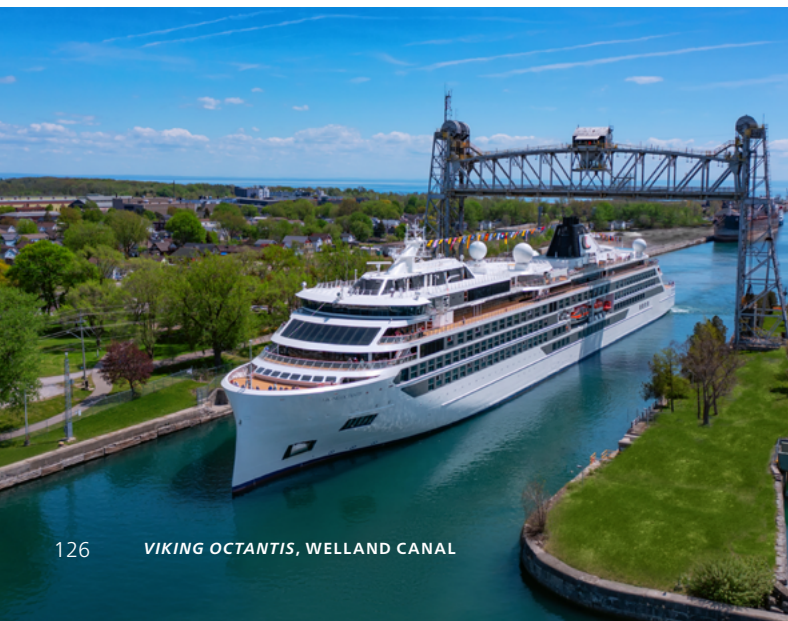
VIKING OCTANTIS, WELAND CANAL