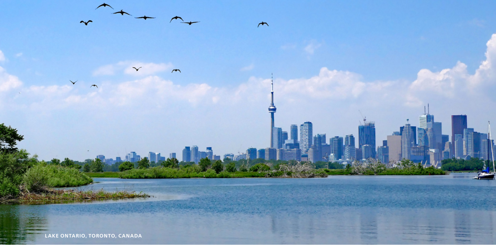
LAKE ONTARIO, TORONTO, CANADA

FROM URBAN SKYLINES TO UNINHABITED ISLANDS, discover North America's wilderness alongside renowned cultural attractions while cruising the striking waterways of the Great Lakes. Immerse yourself in the lakes' compelling shipping history, experience the power of the thundering Niagara Falls and keep watch for scores of migratory birds at Point Pelee. Led by a team of experts, explore sheltered bays and woodlands to uncover complex ecosystems and hidden treasures.