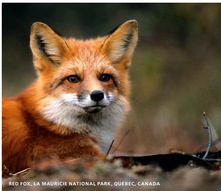
RED FOX, LA MAURICIE NATIONAL PARK, QUEBEC, CANADA