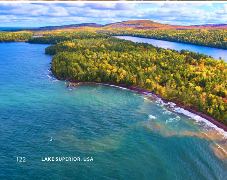
LAKE SUPERIOR, USA