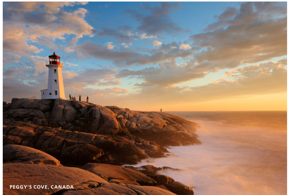
PEGGY'S COVE, CANADA

SAIL THE US'S ATLANTIC COASTLINE AND VISIT STORIED CITIES. Enjoy Charleston's southern charm and colonial homes. Visit Norfolk, home to the world's largest naval base. Trace Nova Scotia's shores to explore its rugged landscapes and visit Quebec's national parks. Traverse one of North America's scenic waterways, the St. Lawrence River, and marvel at the locks and canals that comprise the St. Lawrence Seaway on an enriching journey to historic ports.