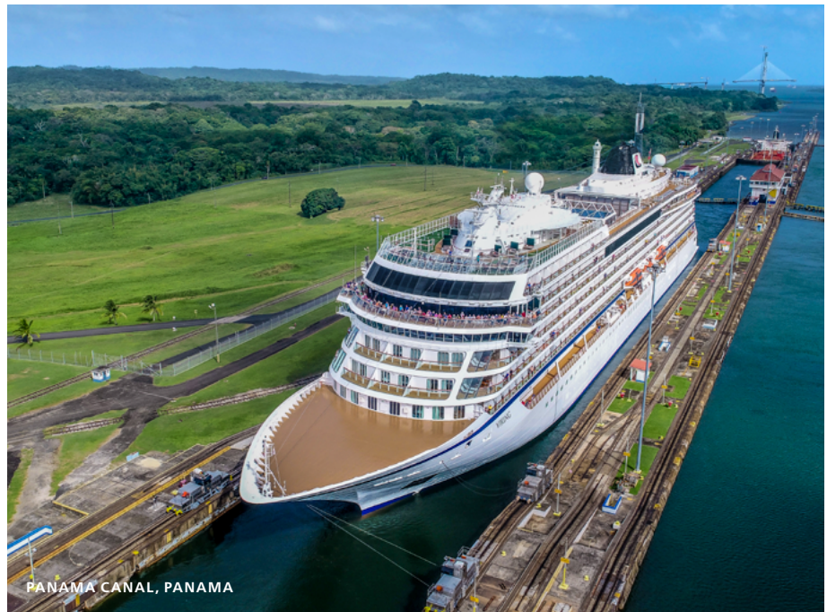
CHART A COURSE ACROSS THE AMERICAS , traversing storied oceans and seas to call on ports bountiful in history, culture and natural beauty. Immerse in the tropical serenity and pristine shores of The Bahamas in San Salvador and Man of War Bay. Transit the Panama Canal, an engineering marvel, and bask in Panama City's rich heritage. Step back in time in Lima's historic center, a UNESCO Site, and admire the sights in Iquique, where desert dunes meet the sea.

DAY 1 SANTIAGO (VALPARAÍSO), CHILE Explore the two scenic halves of Valparaíso or venture to Santiago, Chile's vibrant capital.