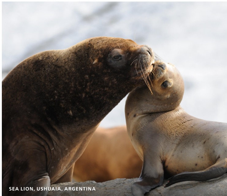
SEA LION, USHUAIA, ARGENTINA