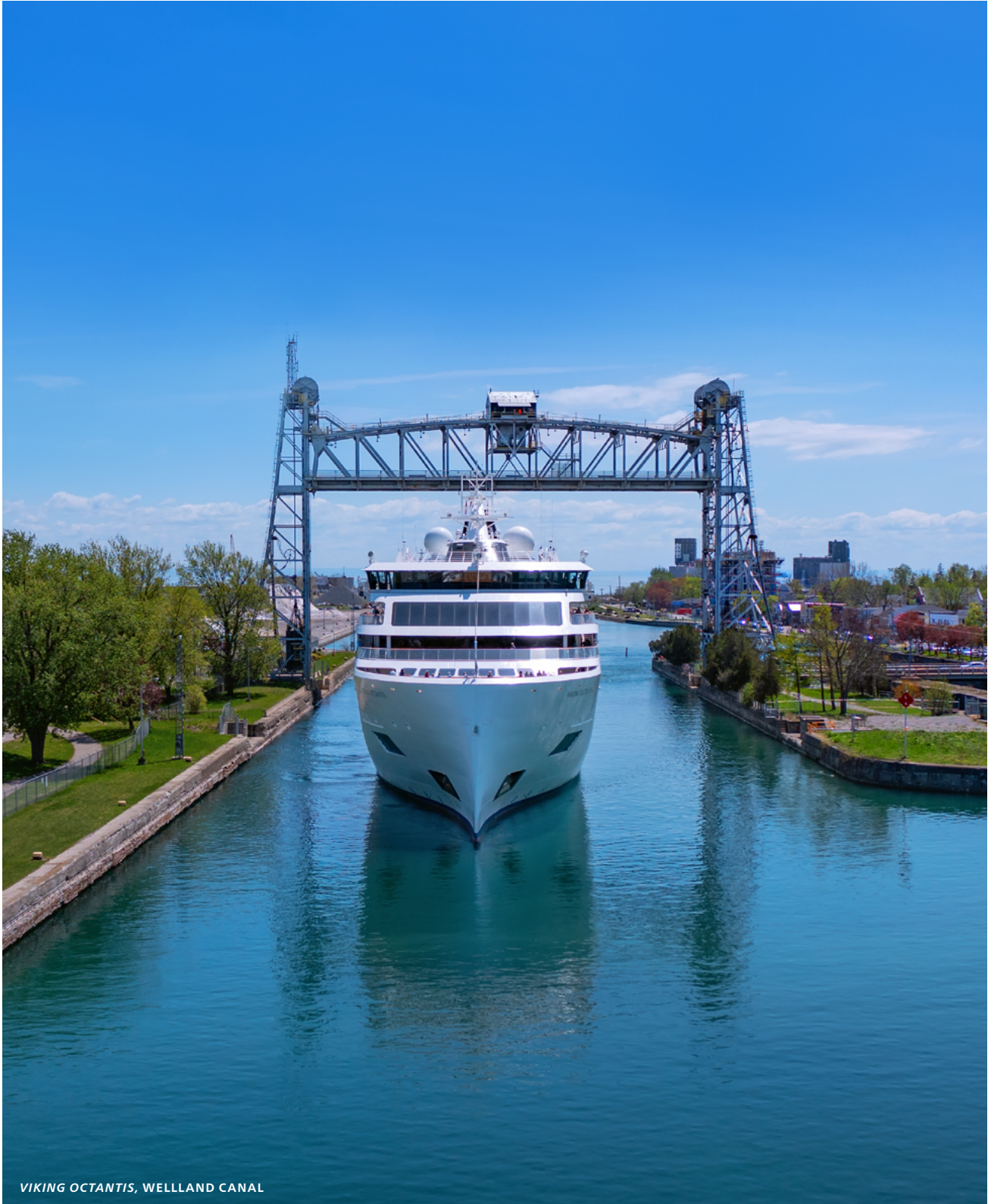
VIKING OCTANTIS, WELLAND CANAL

Extend your journey before or after your Viking cruise with our extension packages — designed to help you explore more of your embarkation or disembarkation point, or discover a new destination altogether. To determine which packages are available with your cruise, check the relevant itinerary or visit viking.com/expeditions