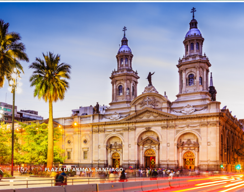
PLAZA DE ARMAS, SANTIAGO