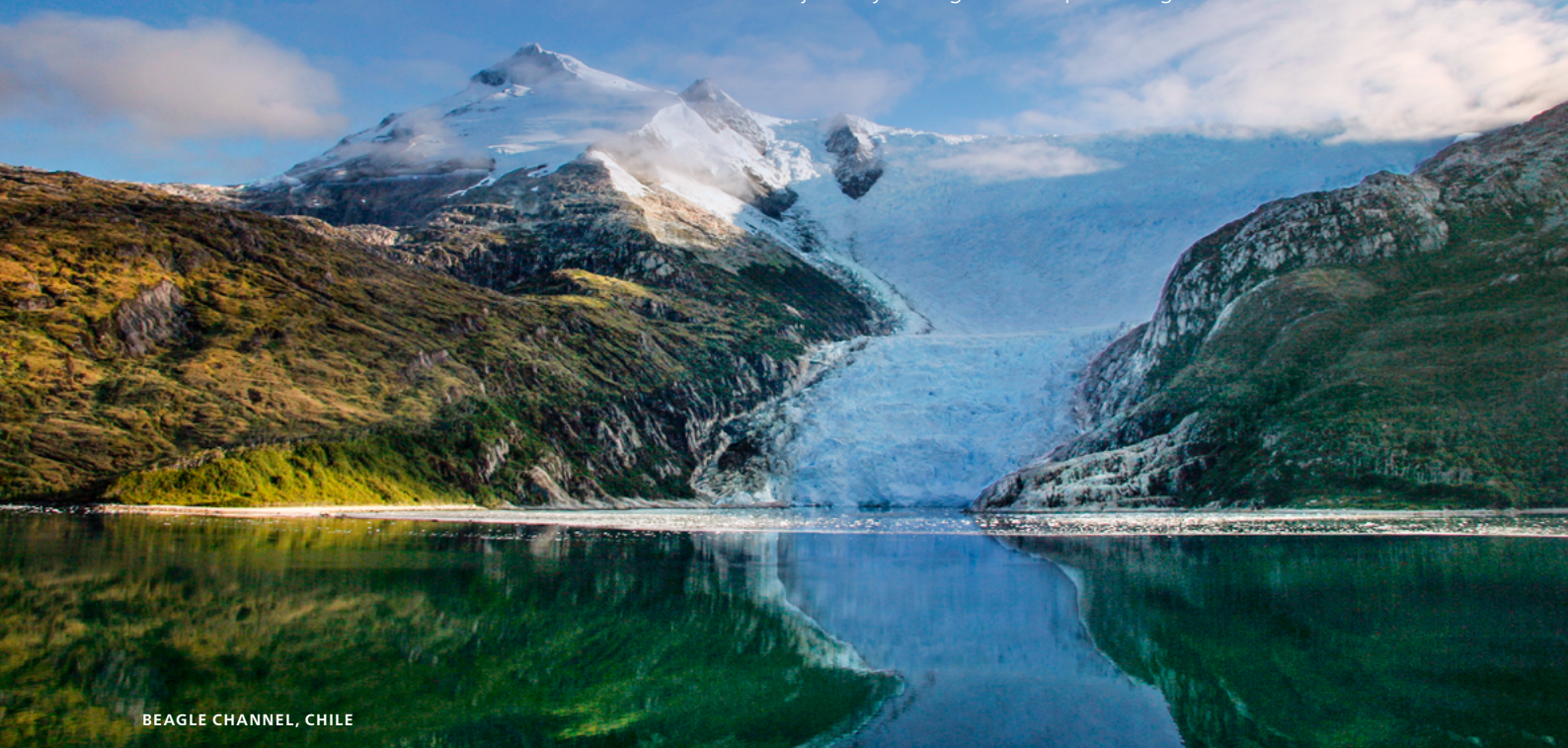
BEAGLE CHANNEL, CHILE

EXPLORE THE UNTAMED LANDSCAPES OF THE MAJESTIC CHILEAN COASTLINE. Overnight in Buenos Aires, then take a chartered flight to your ship in Ushuaia. Admire jagged peaks and looming ice shelves as you navigate channels teeming with icebergs in the Chilean fjords. Follow your team of onboard experts for an up-close encounter with blue-tinged glaciers and gain insight into Patagonian life in Puerto Chacabuco on a memorable journey through this unspoiled region.